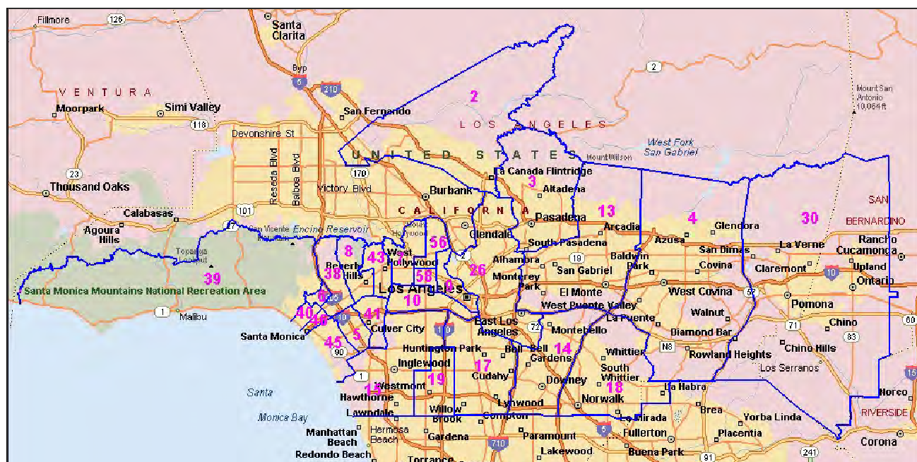
AREA MAP (English-Speaking Districts)